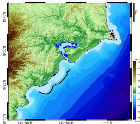
Fig. 1: Bathymetry (m) of eastern Hainan coastal waters. Blue dots indicate areas potentially flooded by sea level rise scenarios. Black triangles show the locations of fringing reefs, which potentially can also be flooded.